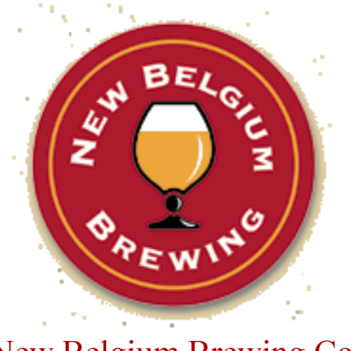
New Belgium Brewing Co.