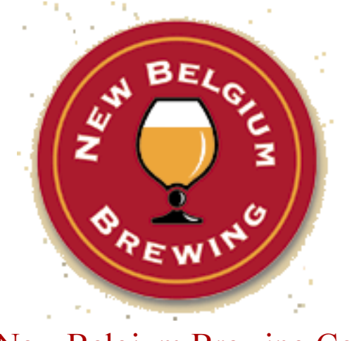
New Belgium Brewing Co.